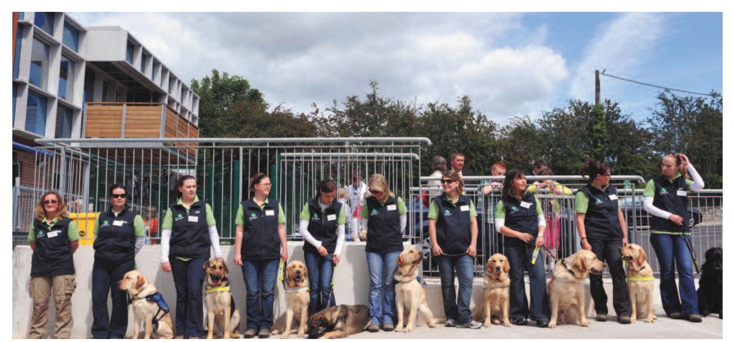
'Train the Trainers' Irish Guide Dogs for the Blind Style!

Should you wish to find out more about the services offered by the organisation, please visit www.guidedogs.ie or call 1850 506 300 and ask to speak with Client Services or you may email info@guidedogs.ie. We would be delighted to provide leaflets for display in your clinics and your direct referrals are welcome.